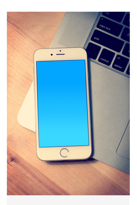
In addition to UI bugs descriptions, you may also get screenshots or videos of failing scenarios.